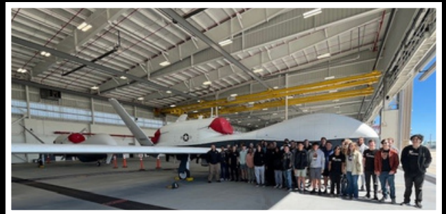
Year 1 Emerging Tech students visit VUP-19 in Mayport