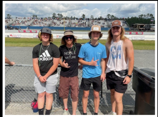
AIBE students at NHRA Steam Day

The final trip of the year will be on 4/26 to a Baston-Cook job site in Durbin Creek!