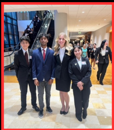
HOSA SLC in Orlando