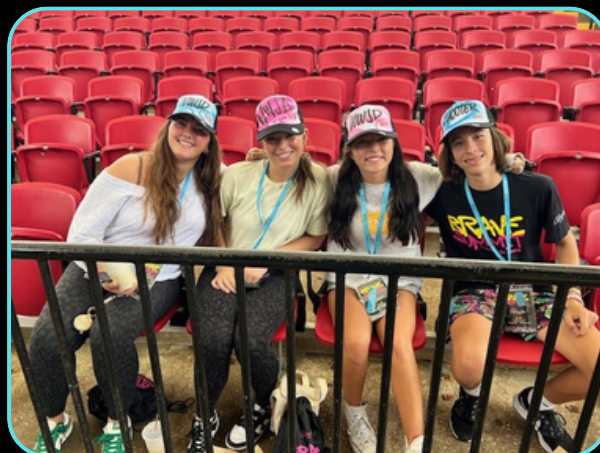
TCHS students at Brave Summit

ACADEMY OF Future Healthcare Professionals TOCOI CREEK HIGH SCHOOL