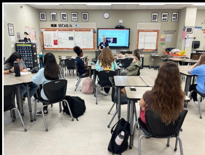
L & D nurse guest speaker