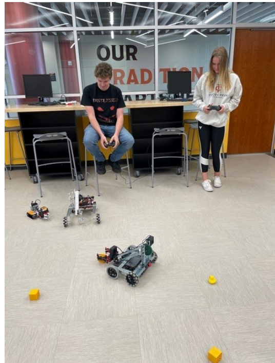
Vex robots in action!