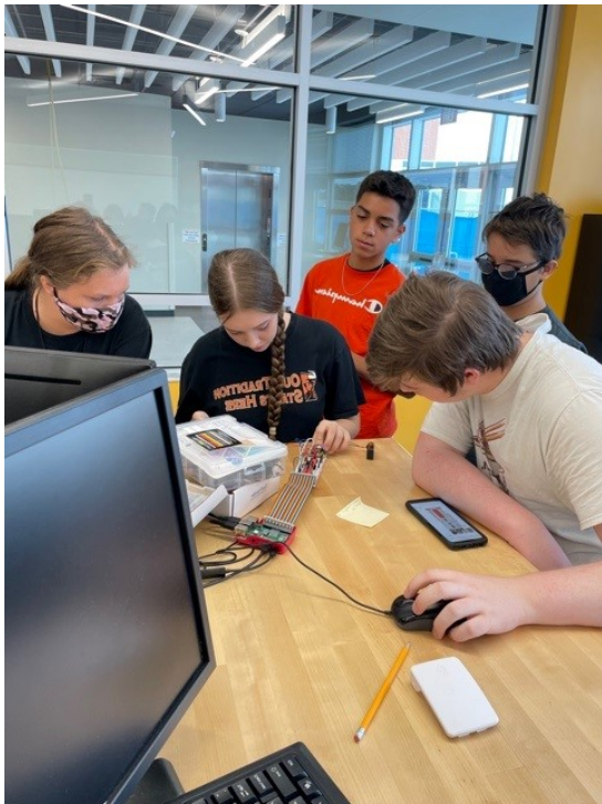
Students creating a temperature sensor-controlled fan

The electives in this academy will emphasize the use of emerging technologies and the leadership, entrepreneurial and technical skills needed to be successful in rapidly changing industries using future technologies. This path provides students with the content and skills essential to the design and operation of robotics, including artificial intelligence, sensors, electronic devices, engineering technologies, motion physics, electrical motors, programming, simulation and modeling and critical thinking skills. Fields related to the design, construction, coding and use of industrial, medical, or commercial robotics will be emphasized. Students will immerse themselves in the use of drones, robotics and design elements/software and equipment related to current industrial, commercial, and medical applications.